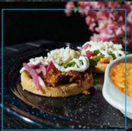
An order of three sopes of fried corn dough topped with beans, sour cream, lettuce and cheese, meat options Azada, Chorizo or Pastor.